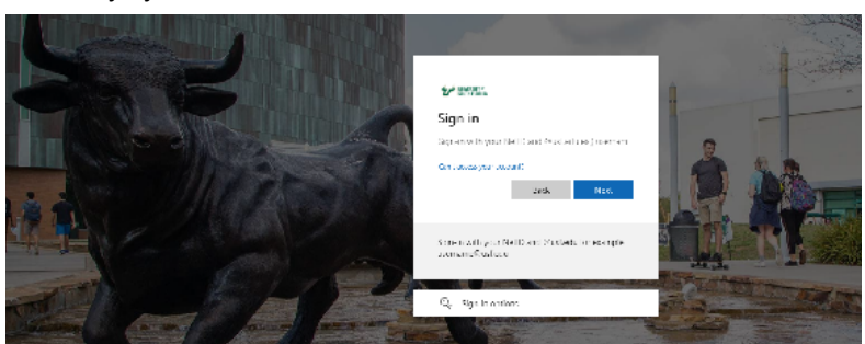
To activate your NetID, please visit <u>netid.usf.edu</u> and select "Activate Your USF NetID".

The NetID is your user ID at the university. Faculty, staff, and students are automatically eligible to obtain a NetID which allows you access to a variety of online services offered at the entire university system.