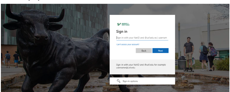
To activate your NetID, please visit <u>netid.usf.edu</u> and select "Activate Your USF NetID".

The NetID is your user ID at the university. Faculty, staff, and students are automatically eligible to obtain a NetID which allows you access to a variety of online services offered at the entire university system.