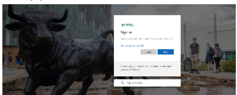
To activate your NetID, please visit <u>netid.usf.edu</u> and select "Activate Your USF NetID".

The NetID is your user ID at the university. Faculty, staff, and students are automatically eligible to obtain a NetID which allows you access to a variety of online services offered at the entire university system.