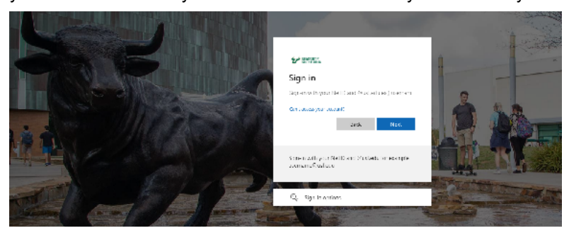
To activate your NetID, please visit <u>netid.usf.edu</u> and select "Activate Your USF NetID".

The NetID is your user ID at the university. Faculty, staff, and students are automatically eligible to obtain a NetID which allows you access to a variety of online services offered by the university.